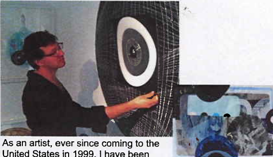
"Tierra Azul Territories"

As an artist, ever since coming to the United States in 1999, I have been interested in the properties of contemporary materials, such as plastic, acetate, vinyl, polycarbonate and Mylar. I play with light, transparencies and the sculptural qualities of these elements in order to evoke the concepts that are important in my work: time, change and movement.