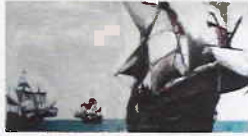
"La Nina, La Pinta y La Santa Maria"